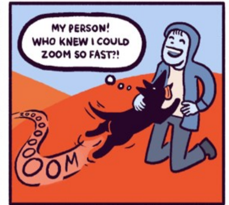
BERMAN, FOEHL, TROWER 2017