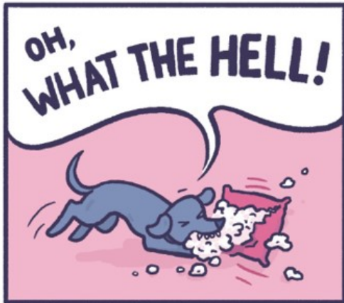
BERMAN, CHITUC, TROWER 2017